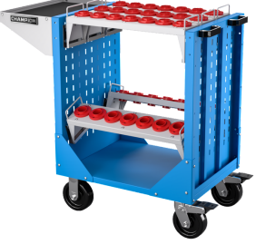
NCTC-XX CAT TOOL HOLDERS