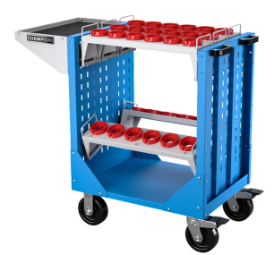
NCTCH-XX HSK TOOL HOLDERS