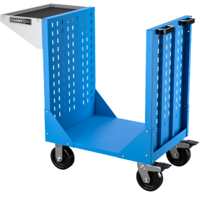
NCTC-XX NO TOOL HOLDERS