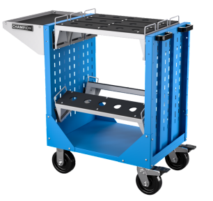
NCTCC-XX CAPTO TOOL HOLDERS