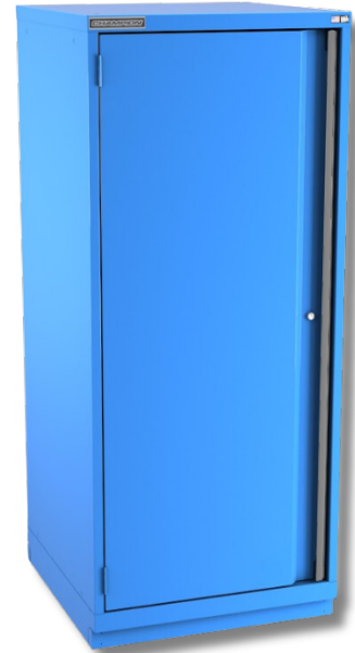
STANDARD FLUSH DOOR CABINET

Shallow Depth 22.5" Standard Depth 28.5"