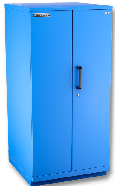
OPTIONAL DOORS OVER DRAWERS